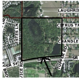
MPUD Property Aerial Photograph

Pasco County Fire Rescue Station 16 34335 Chaney Road Zephyrhills, FL 33543