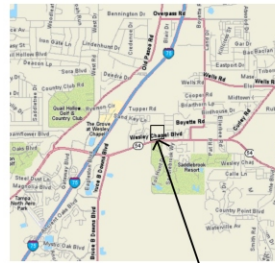
MPUD Property Location Map